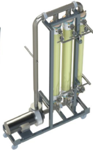
Wine-COR M Expansion Module